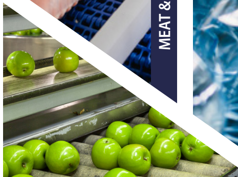
FRUITS &amp; VEGETABLES