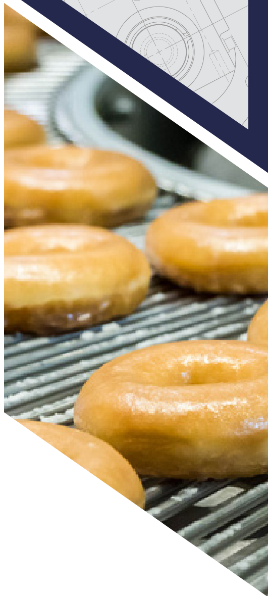
FOOD PROCESSING &amp; PACKAGING