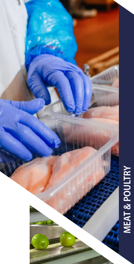
MEAT &amp; POULTRY